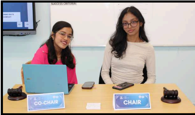
GA1 General Assembly 1