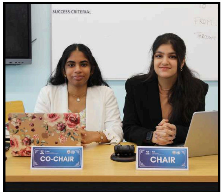
GA3 General Assembly 3